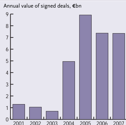
Chart 2 PPP contracts in Europe (excluding UK)

In addition to 193 contracts signed elsewhere in Europe up to 2007, DLA Piper estimates that further projects to the value of €68bn were being procured elsewhere in Europe at the beginning of 2007 (Table 5). This total aggregates current projects in tender or in the process of being financed and has risen from €55bn in 2006. Italy is much the largest market with projects to the value of €30bn being procured. Of this €13bn relates to motorway and highway projects, €4.4bn to the Rome and Modena metro, €3.9bn to the Messina bridge, €2.6bn to water projects in Sicily and €2.0bn to hospitals. Germany and Greece are the next largest countries for procurement with €9.5bn and €6.3bn respectively. The further rise in procurement points to steady growth in signed PPP contracts in Europe over the next few years.